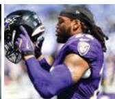
Derrick Henry at +400 odds

fact, the next highest running backs were almost 500 yards BEHIND these guys (Bijan Robinson 1456 yards / Jonathan Taylor 1431 yards). We really like those #3 and #4 guys (Robinson and Taylor), and we'll get back to them in a minute. First off, let's finish our look back. Last year, Saquon Barkley (+700) ended a two-year run of longer-shot winners in this category. Josh Jacobs (+4000) and Christian McCaffrey (+3000) came from deeper in the pack to lead the league in rushing yards in 2022 and 2023, respectively. Backs ranked in the top four in odds have taken home the honor seven times in the last decade. Kareem Hunt (+20000) is one player who came from out of nowhere to lead the league as a third-round pick in 2017. Barkley joined the 2000-yard club with Derrick Henry (+600), who did it during the 2020 season. The league leader in rushing yards fell below the 100 YPG pace for three straight years in 2017-19. Henry and Jonathan Taylor (+900) blew past the century mark in 2020-21, while Jacobs (97.2 rushing YPG) and CMC (85.8) fell below the century mark per game standard in 2022-23. It comes as no surprise that the rushing yards leader has checked in at 27 years old or younger in nine straight seasons. Adrian Peterson (+500) was the last "older" back to win the rushing crown at 30 years old.