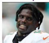
Tyreek Hill at +1500 odds