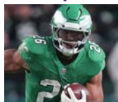
Saquon Barkley at -275 odds