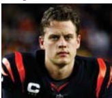
Joe Burrow at +550 odds