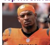
Ja'Marr Chase at +600 odds