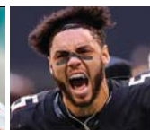
Drake London at +2000 odds

Our original article did NOT include the #1 Miami Wide Out (Tyreek Hill). But with the significant trades of June 20th, we are now compelled to wager some futures money on our boy 'CHEETAH'! Number One, he's been there... and one that (as recently as two seasons ago). He averaged 106.3 receiving YPG in 2022-23 before a training camp wrist injury derailed his 2024 campaign right out of the gate. He averaged just 56.4 receiving YPG and failed to reach 1000+ yards for the first time since 2019. Hill underwent right wrist surgery this off-season, and he's moved past the trade demands he made after last season's final game. He said this spring that he's hoping "I can prove myself and prove to my teammates that I'm still one of them ones, man, who's chasing 2K [receiving yards]." Hill appears locked in at the start of the summer. He even ran the 100-meter dash in a personal-best 10.15 seconds in preparation