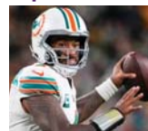
Tua Tagovailoa at +2200 odds